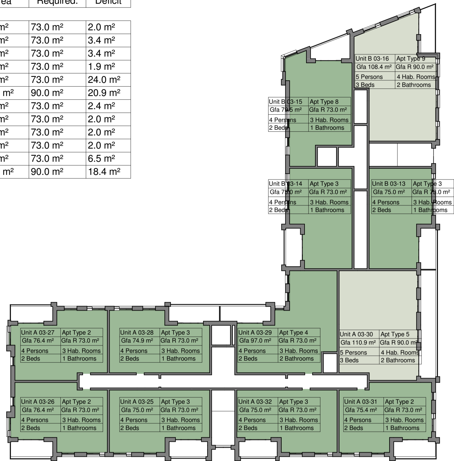
2 L03_01 Third Floor Area Plan 1:250 @ A3